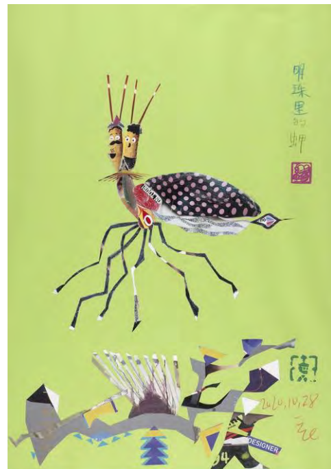
Beetle of Mingzhuli , 2020 coloured pencil and collage on paper 42 × 29,6 cm