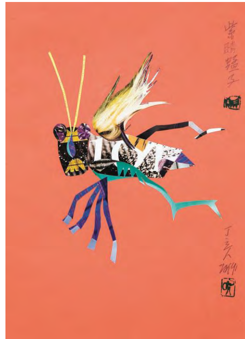
Purple-eyed Locust , 2019 coloured pencil and collage on paper 42 × 29,6 cm